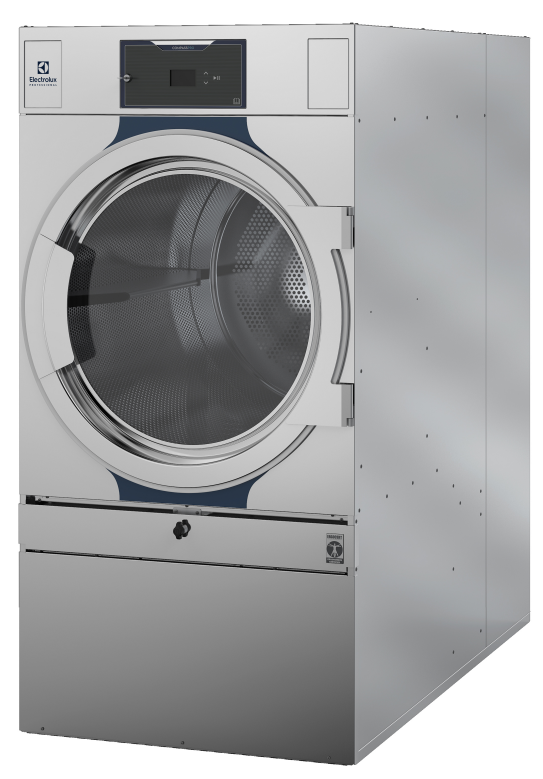
Images shown are a representation of the product only and variations may